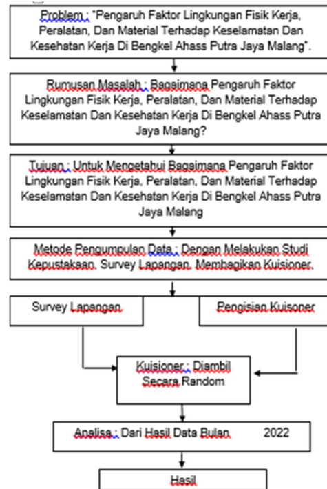
Figure Framework of thought Hypothesis

The framework of thinking is basic thinking from study Which adjusted to the facts. This research aim For know influence fact environment physique Work, equipment And material to safety And health Work in workshop ahas son victorious Poor. By systematic, framework think in study This can depicted as following